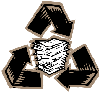
Paper, Magazines, and Slick Inserts