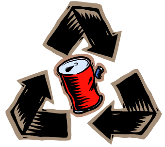
Aluminum and Steel (Tin) Cans Rinse & Leave Labels