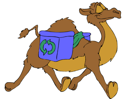
I Recycle, Do You?