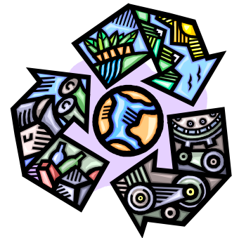
I Recycle, Do You?