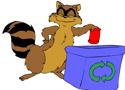
I Recycle, Do You?