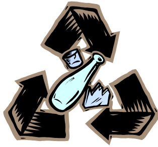
Glass Jars and Bottles Rinse and Remove Lids